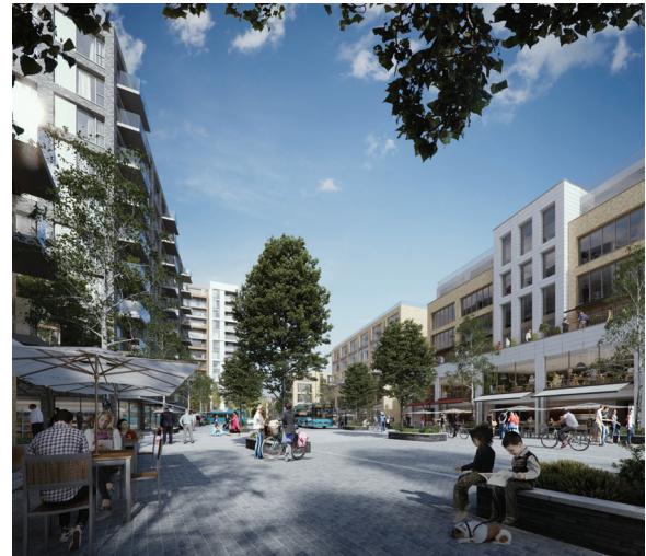
CGI showing new centre with housing and local shops

We previously held a public consultation in July to show the initial vision for the proposals. This exhibition will show the updated plans in preparation to submit an outline planning application in December (please see overleaf for details).